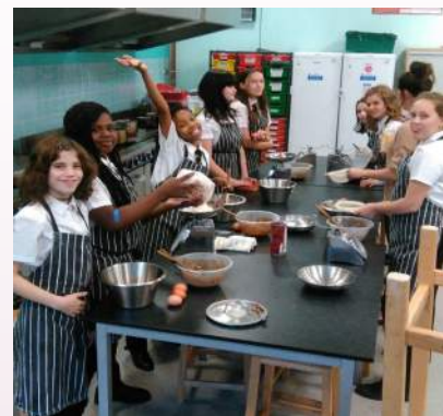
Cooking is good fun after school!!

We have lots of projects running and will even create a project for you if you tell us what you want!