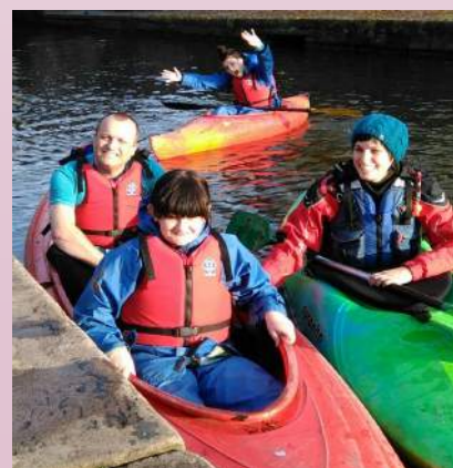
Fancy going canoeing?