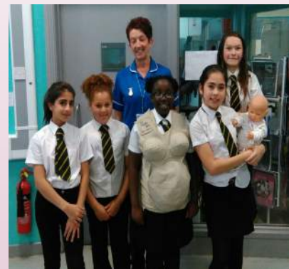
Want to be a midwife or interested in another career?